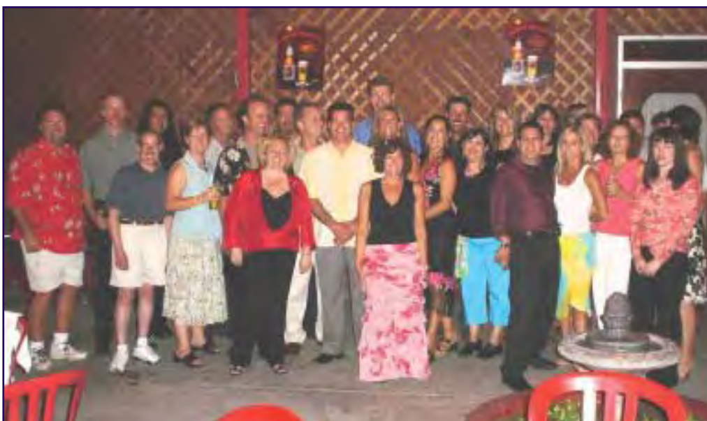
Members of the Class of 1985 took time out of reunion festivities to pose for the camera.