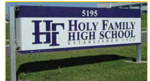
HFHS Classes of 2000 & 2001 contributed to the purchase of the school sign.

If your class would like more information on how you can leave a lasting gift to HFHS, please contact the School Advancement Office.